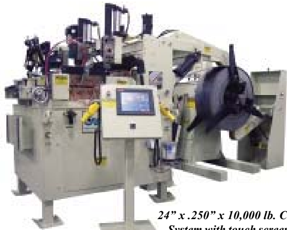
24" x .250" x 10,000 lb. Compact Coil System with touch screen interface

When approached to supply a compact system to handle 24" x .250" x 10,000lbs in an environment which would be processing partial coils CWP supplied a compact system to satisfy the customer requirements. The CWP system utilized a motorized uncoiler with photo eye loop control to allow the slack material to develop directly below the uncoiler spindle. Both primary and secondary hold down arms were provided with powered rider rolls for thread-up and to allow for rewinding the slack material during partial coil operation.