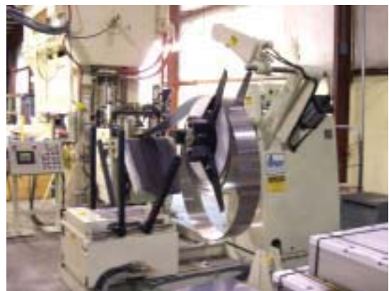
CWP Compact Coil System features ability to payoff the top or bottom of the coil

CWP supplied a compact coil system with a motorized reel, that utilized a dual operation mode to allow the coils to payoff the top or the bottom. The coil car is supplied with power thread-up assist rolls to be utilized when threading up material which will pay off the bottom. This feature allows the lead edge of the strip to be forced straight up into the guide chute on the entry end of the straightener/feeder for hands free thread-up. The straightener/feeder unit is also supplied with pneumatic roll release to allow the upper feed and straightening rolls to open and allow the pilots to register the material into position.