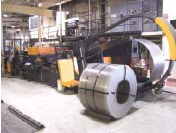
One of the three Compact Coil Systems previously purchased by Blount

be installed in a section of their facility which only had an overhead crane capable of picking the coils 35" off the ground to be loaded into the CTL systems. The system needed to be interfaced with their download communication requirements as well.