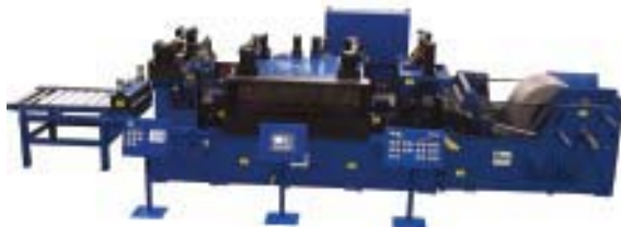
Compact Coil System allows for back load of coils directly into the cradle section

The new system, which was required to handle 40" x .437" x 30,000lbs with a material yield of 60,000psi, was built with a coil cradle entry section designed to payoff the bottom of the coil in place of the older ROWE units which paid material off the top through an overhead loop chute arrangement. This new design allows for a back load of the coils directly into the cradle section of the system. A heavy duty hydraulic debender unit accepts the lead edge of the coil and breaks it for easy thread-up into the straightener/feeder unit.